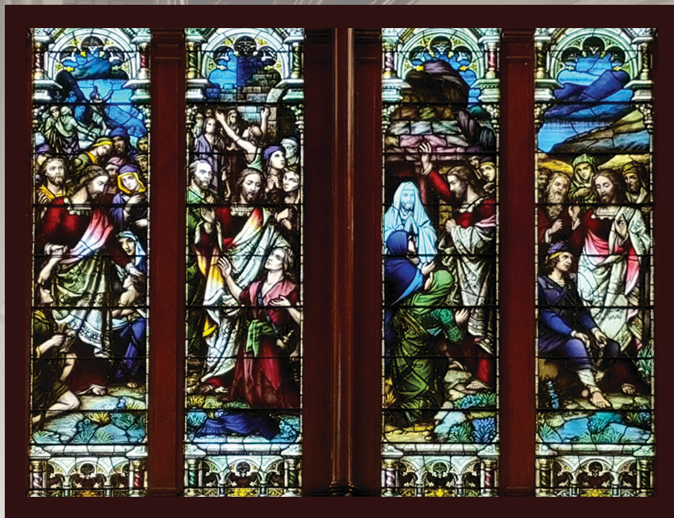
South Auditorium Transept Windows